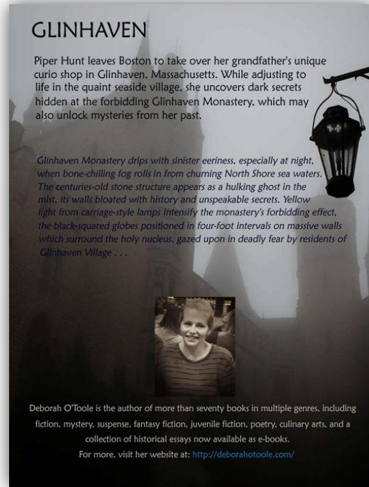
(Above): The most recent front and back covers for "Glinhaven" (2019).

Thanks to Simona Dumitru for approved use of the original cover (black lamp in the foggy night). The photo was actually taken in Budapest, Hungary. However, in my book it represents a fictional village named Glinhaven near Gloucester, Massachusetts.