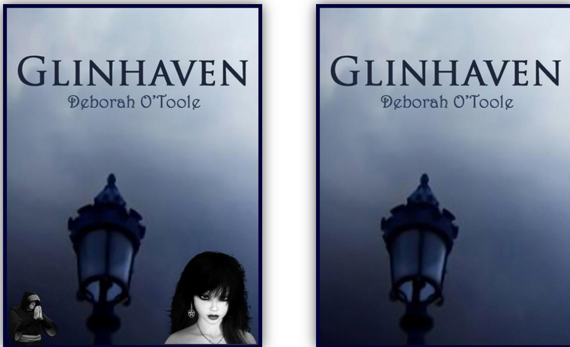
(Above): Original cover for "Glinhaven" (left), and the second edition without human figures (right).

That being said, Glinhaven has a varied book cover history. Although the main premise has always remained the same (a dark, hulking stone edifice in the mist, meant to signify the Glinhaven Monastery), over the span of a decade it has undergone a few changes.