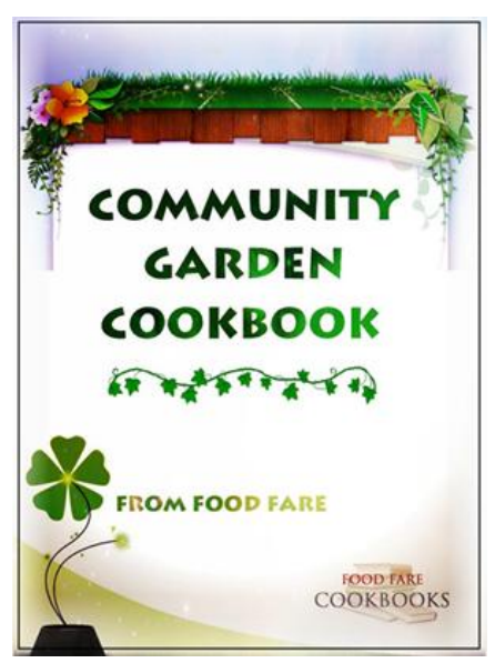
Community Garden Cookbook ©2012 Food Fare/Shenanchie Web: http://shenanchie.tripod.com/FoodFare/

http://www.kobobooks.com/ebook/Community-Garden-Cookbook/book-TzpWwlVtGEqXFEGKKPARfA/page1.html?s=jigXiUcPAUKWjoKswyfhaQ&r=6